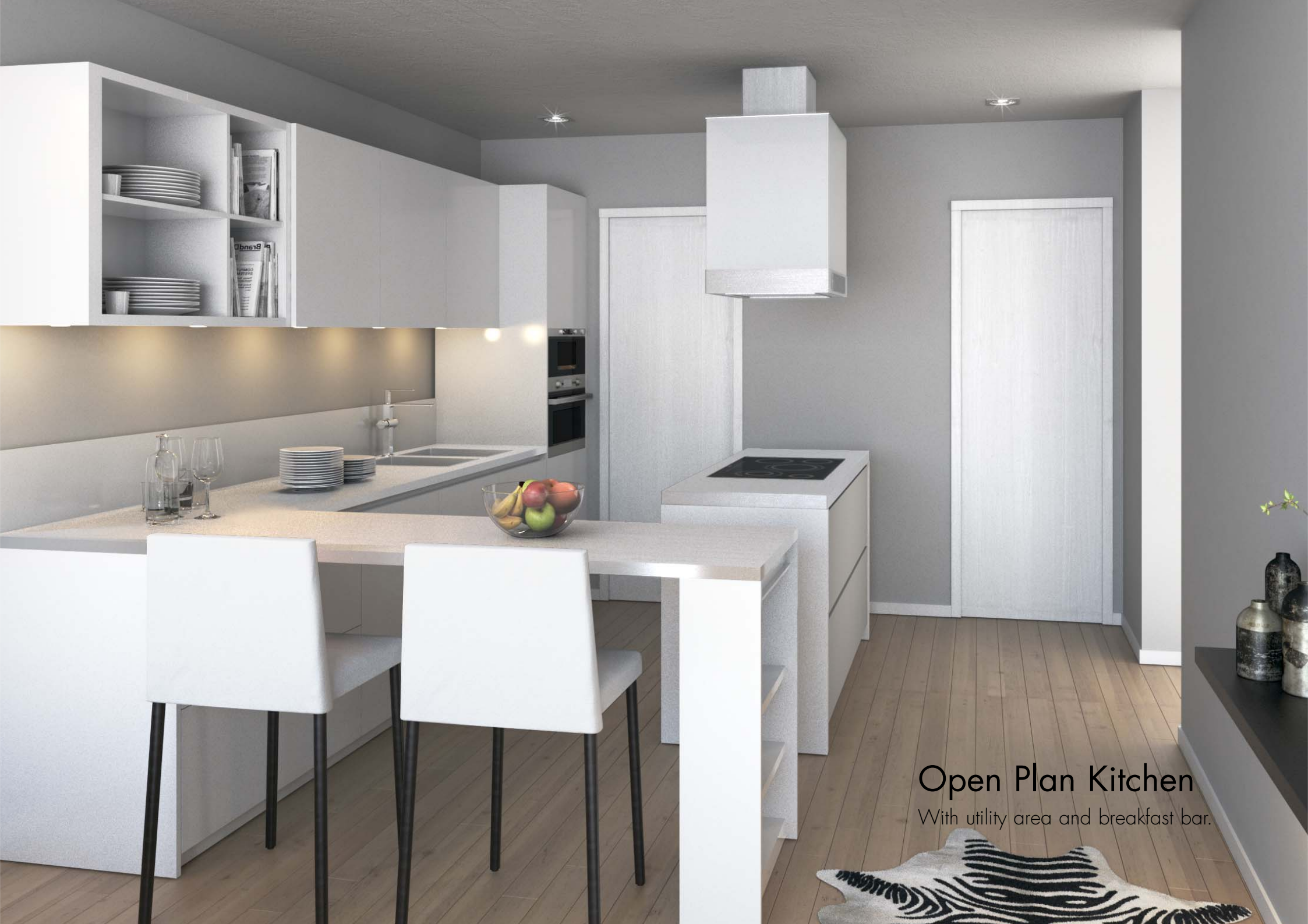
Open Plan Kitchen With utility area and breakfast bar.